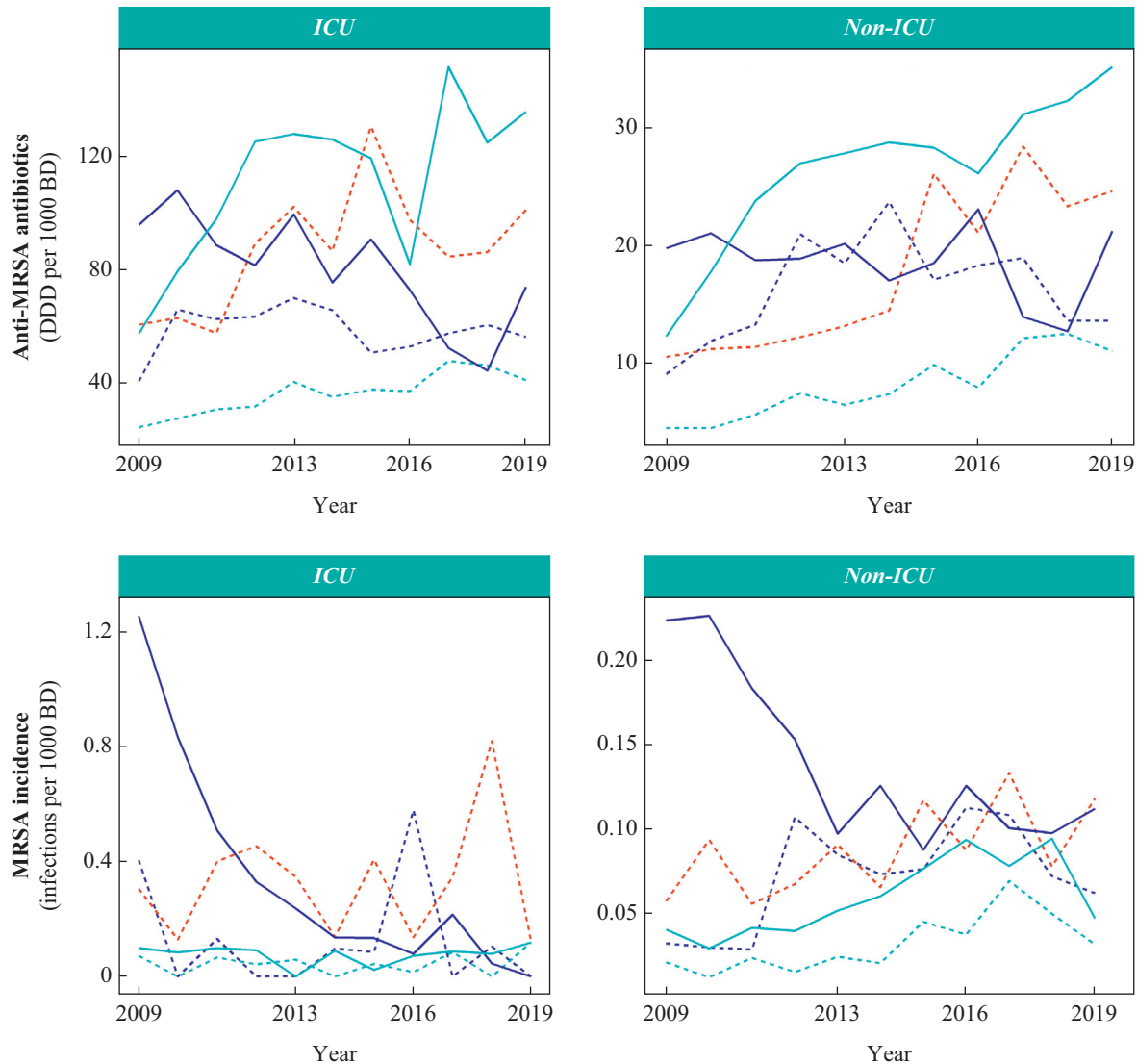
Figure 2. Median consumption of anti-MRSA antibiotics (defined daily doses (DDD) per 1000 bed-days (BD), upper panels) and MRSA incidence (invasive infections per 1000 bed-days, lower panels) in university (solid line) and non-university (dashed line) hospitals of the French-speaking (dark blue), German-speaking (light blue) and Italian-speaking (red) regions of Switzerland between 2009 and 2019 in intensive care unit (ICU) (left panels) and non-ICU departments (right panels).

treatments were available in eight (53%) and four (27%) of all hospitals, respectively. However, in four out of 11 (36%) hospitals without MRSA/VRE guidelines, a consultation from an ID specialist was automatically triggered after an MRSA or VRE infection. In one out of 15 hospitals (7%) a limitation in treatment days for intravenous glycopeptides was in place. More hospitals had restrictions on prescriptions for daptomycin (87%) than on those for linezolid (80%) or glycopeptides (27%). Common restrictions included an obligation to consult an ID specialist or the chief physician before prescription of anti-MRSA antibiotics or automatic limitation of the treatment duration. Other restrictions were the consultation of an ID specialist or validation by a clinical pharmacist. The recommended daily daptomycin doses for the treatment of skin and soft tissue infections ranged between 4 and 10 mg/kg body weight (BW). The recommended dosage in university hospitals was higher, with a median of 8 mg/kg BW (interquartile range: 6–8 mg/kg