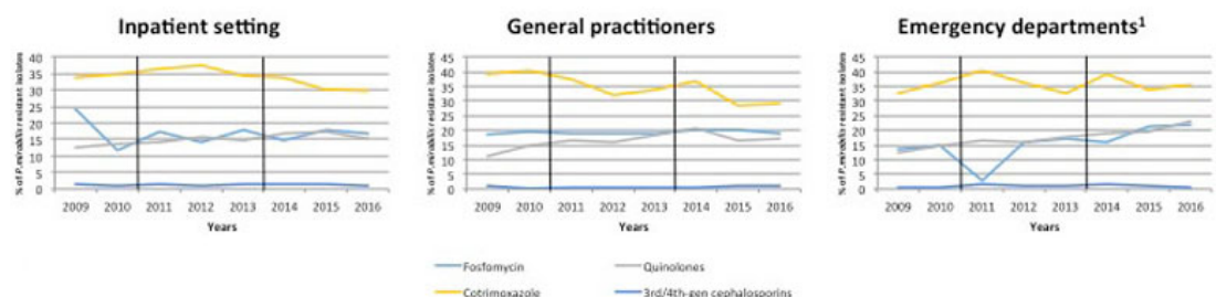
Figure 3: Proportion of resistant P. mirabilis isolates from urine samples collected from inpatients and outpatients between 2009 and 2016 in Switzerland. Data were provided by ANRESIS, the national laboratory-based antimicrobial resistance surveillance system. Vertical black lines indicate the time period of the switch from CLSI to EUCAST breakpoints. Nitrofurantoin resistance data are not presented since P. mirabilis is considered to be intrinsically resistant. 1 Includes outpatient clinics within hospitals

Interestingly, we described similar proportions of resistant isolates and increases over time between the samples collected at hospitals and those from outpatient clinics,