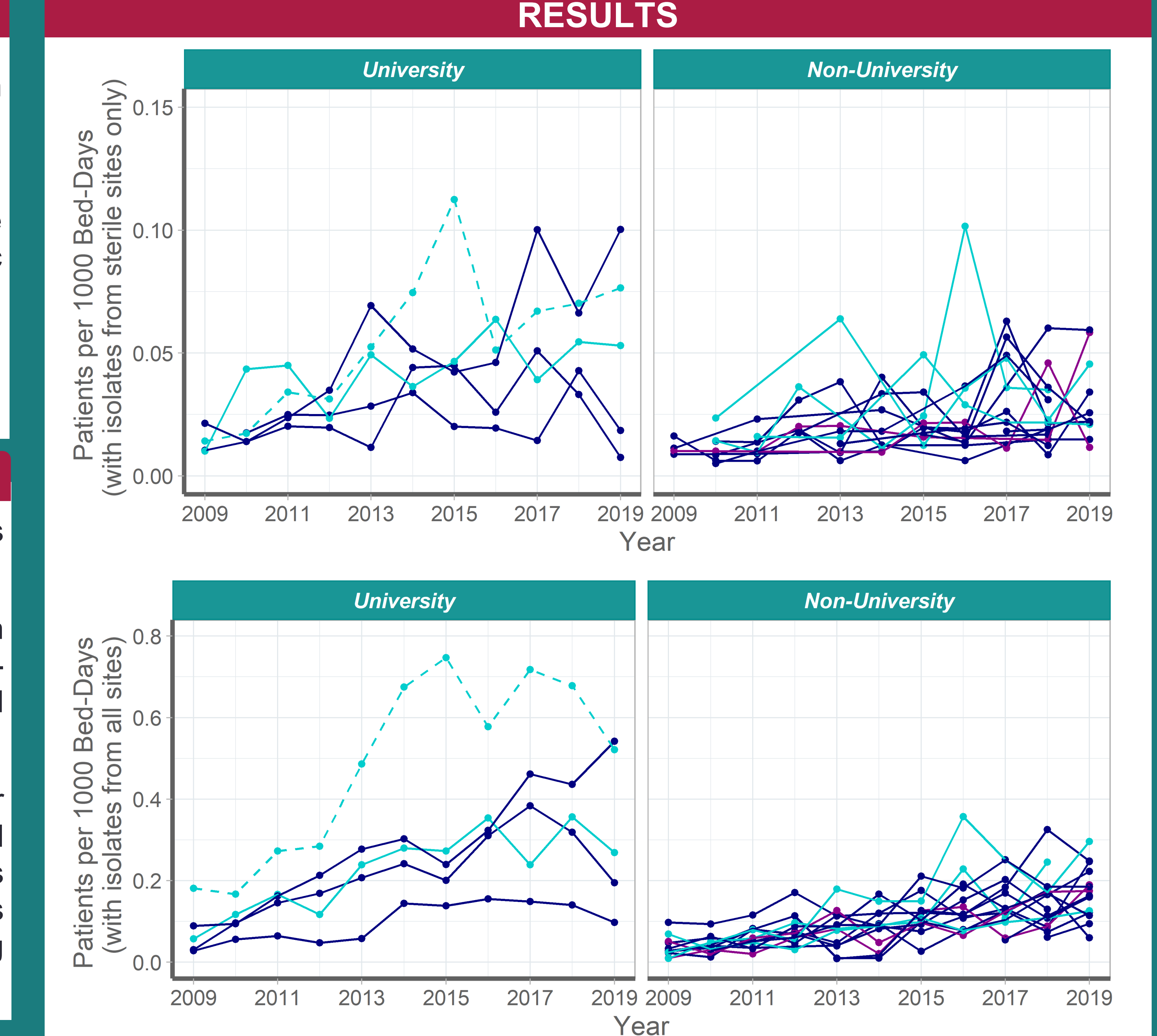
Figure 1: Incidence of invasive ESCR-KP infections ( upper panels ) and overall ESCR-KP incidence (clinical and screening isolates, lower panels ) in university hospitals ( left panels ) including Geneva ( dashed line ) and non-university hospitals ( right panels ) depicted per linguistic region and year. Consider different y-scales.

Linguistic Region → German → French → Italian